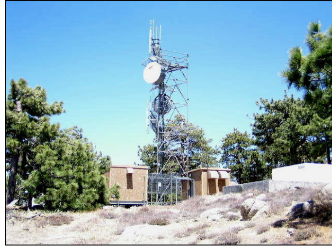
Photograph 2: View toward Santa Rosa Peak candidate location, facing northwest.