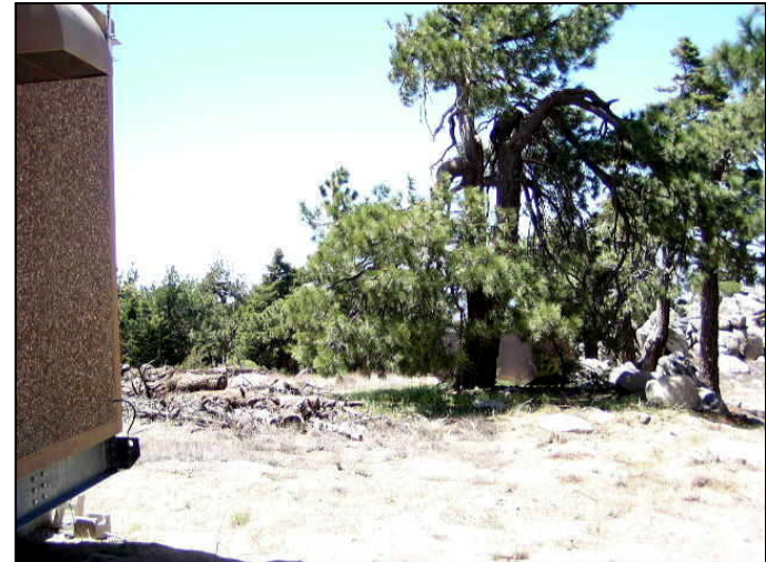
Photograph 8: View from Santa Rosa Peak candidate location, facing northwest.

Source: Michael Brandman Associates, 2008.