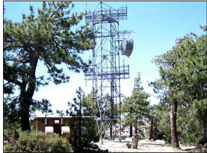
Photograph 4: View toward Santa Rosa Peak candidate location, facing northeast.