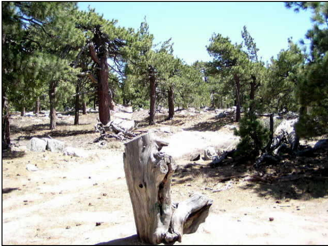
Photograph 5: View from Santa Rosa Peak candidate location, facing southeast.