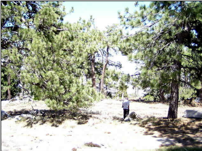
Photograph 7: View from Santa Rosa Peak candidate location, facing northeast.