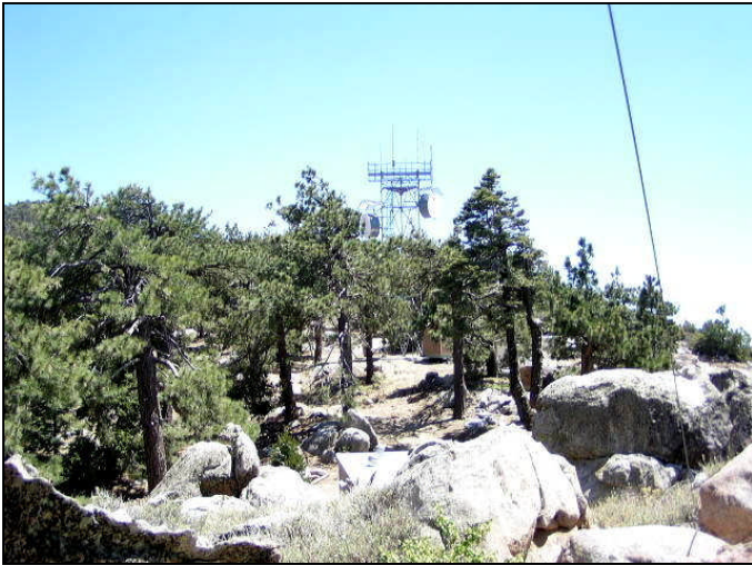
Photograph 3: View toward Santa Rosa Peak candidate location, facing south.