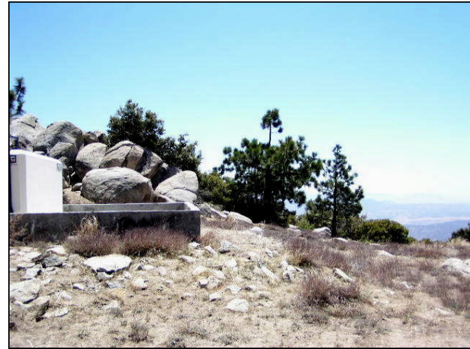
Photograph 6: View from Santa Rosa Peak candidate location, facing southwest.