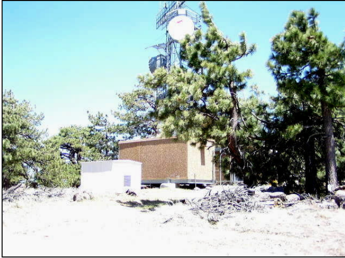
Photograph 1: View toward Santa Rosa Peak candidate location, facing east.